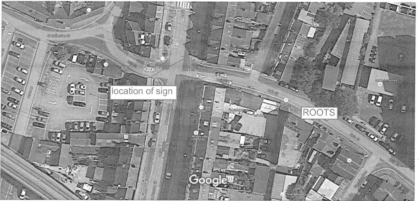
Imagery ©2015 Infoterra Ltd & Bluesky, The GeoInformation Group, Map data ©2015 Google 10 m